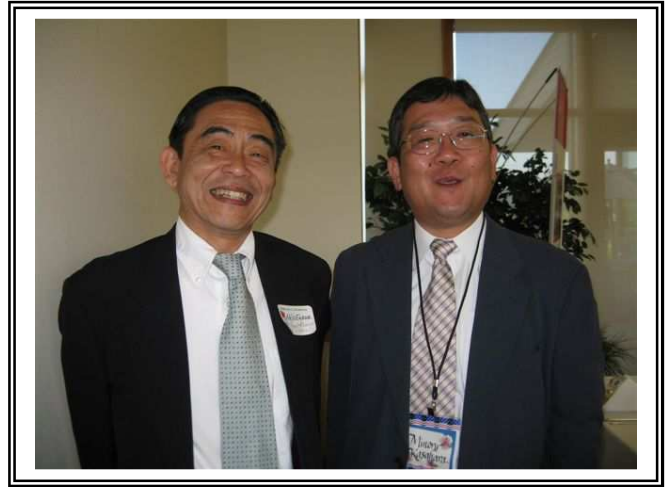
Akio Egawa Japanese Consul General