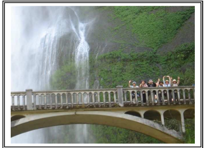
Minoru Kasahara Shobu Vice Mayor